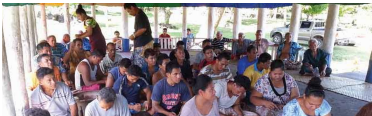
Community survey in Savai'i, Samoa.

The social perceptions, cultures, norms and environmental conditions of communities should be factored when designing tools, methods and policies for effective adaptation and resilience to climate change.