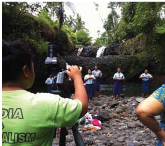
Students from Loto Taumafai, a school for students with disabilities in Apia Samoa, filming on set.

As youth are the future leaders of PICs, there is a long-term benefit in developing their knowledge and understanding of the climate change issues that will impact future generations. In addition, over half of Pacific Islanders are under the age of 24 and yet they are often not included in the conversations and decisions about climate change responses and solutions. Women and persons with disabilities also represent groups whose voices are not often heard in climate change discourse. The PACMAS Action Against Climate Change (A2C2) initiative targeted youth, women and persons with disabilities to tell their stories on DRR and climate change. The project aimed to increase awareness and knowledge of climate science, impacts and adaptation options, and communicate local home-grown solutions for climate change and DRR to encourage positive influence on policy.