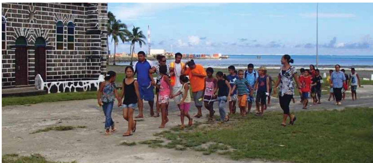
Evacuation simulation, community training.

The thorough and participatory review of response plans will impact positively on government and stakeholders to respond to disasters efficiently and in a coordinated manner. Other improvements (e.g. new equipment, broader radio coverage, and village-level preparedness for early warning and evacuation) also contribute to improved communication and local reactivity during disaster times.