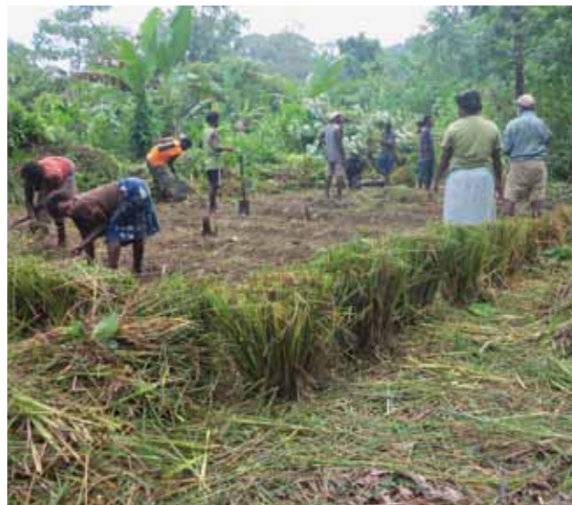
Participants learn about climate-smart vegetable production.

The Malaita Community Resilience and Livelihoods (CRL) Project was developed with a primary focus to enhance community resilience in the face of climate change. The project works with residents to improve their resilience through better knowledge, self-organisation, networks and community plans to drive community disaster preparedness; the adoption of sustainable and profitable livelihood practices; and adoption of improved financial management skills at household and collective levels.