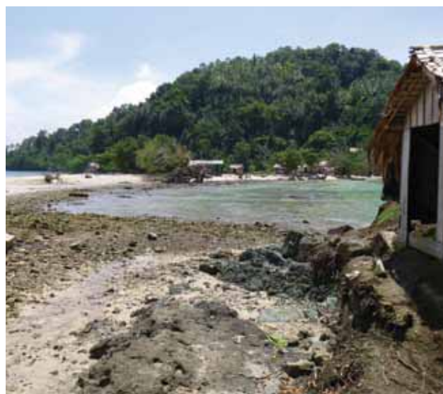
Nuatabu Village identified as suffering from coastal erosion issues by Province -wide Vulnerability and Adaptation Assessment.

Programmes must coordinate exit strategies with national and provincial stakeholders to facilitate successful approaches and adaptation interventions that are sustained and up-scaled.