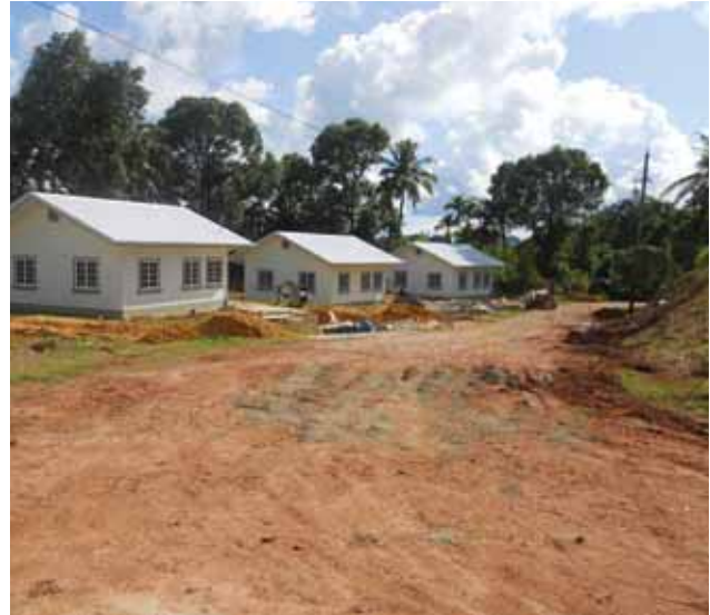
Newly constructed energy efficient housing in Palau.

Recognising that improving the efficiency of energy use has greater short term value on reducing consumption of fossil energy than any other action, the Palau National Energy Policy (2010) states that energy efficiency standards for new buildings and renovations, including homes, businesses and government premises are to be introduced. The policy target is set at a 30% reduction in overall national energy consumption by 2020.