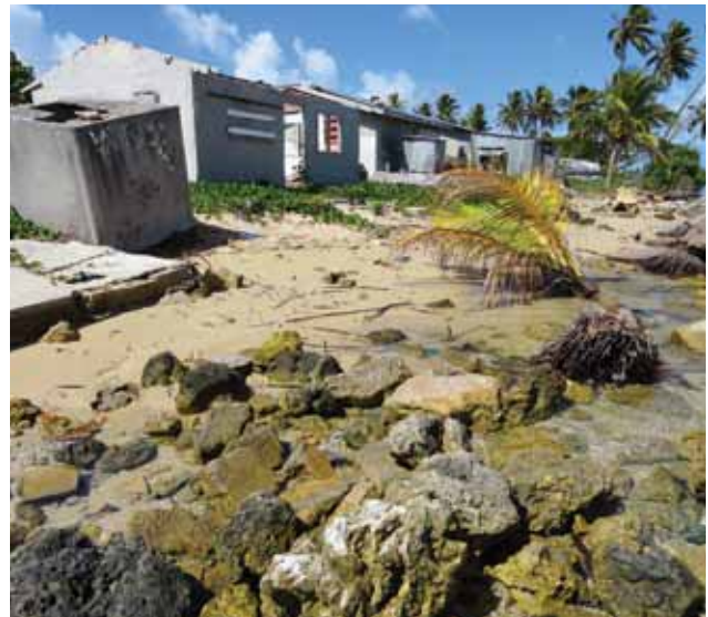
Damaged coastline and houses, Lifuka, Tonga, March 2012.

The project was developed and implemented as a partnership between the Australian Government's Pacific Adaptation Strategy Assistance Program (PASAP), the MLSNRECC, the Secretariat of the Pacific Community (SPC) and the Tonga Community Development Trust.