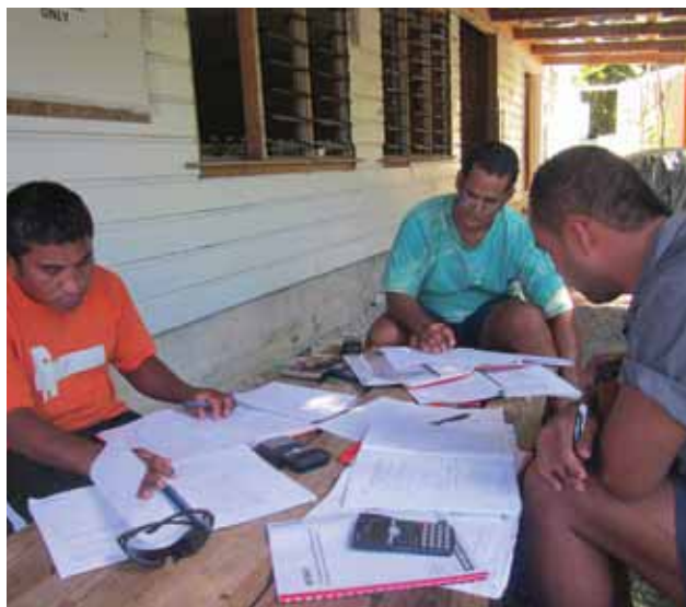
Tokelau Energy Team on their study time. This is part of ongoing training to increase local capacity on the maintenance of Solar PV systems.

http://www.irena.org/DocumentDownloads/events/Workshop_Accelerated_Renewable_Energy_Deployment/Session7/S7_1Forumpresentation2.pdf http://tokelau.org.nz/site/tokelau/files/NEPSAP%20Main%20Text.pdf