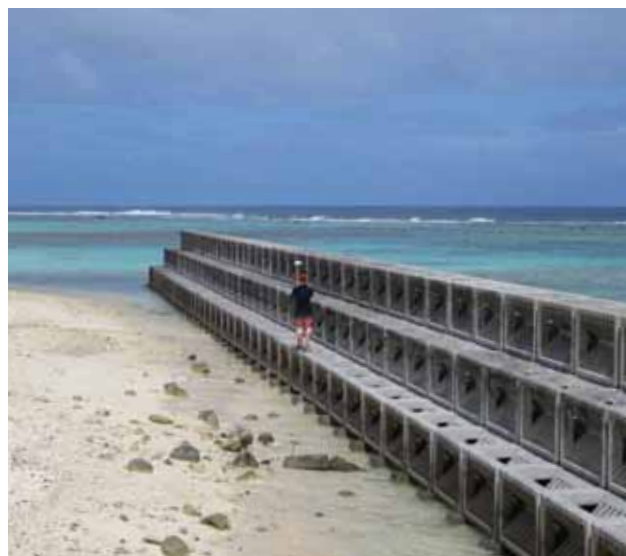
Surveying the harbour COPED Breakwater, Avarua Nikao, Rarotonga, Cook Islands.

Recognising the critical importance of the Avarua area to the economy of the Cook Islands and the urgent need to reduce the vulnerability of the area to cyclones, the Government of Cook Islands and the Water Research Laboratory (UNSW Australia) initiated the Coastal Adaptation for Extreme Events and Climate Change, Avarua, Rarotonga project. The project aimed to: understand the risk posed by changes to sea level and wave climate on coastal infrastructure and the community, particularly during extreme events; identify needs and develop options for response to the risks; and build local capacity to understand the science and manage the risk assessment and planning process.