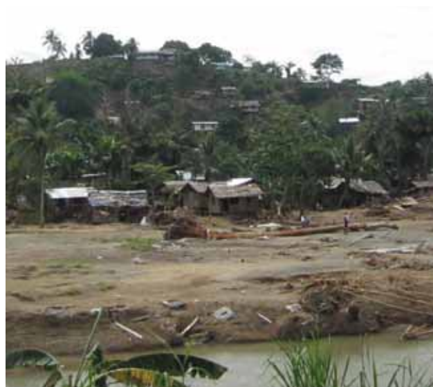
Damage to along the banks of the Matanikau River, Honiara, Solomon Islands after the 2014 floods.

As seen from the payout to Tonga following Tropical Cyclone Ian, catastrophe risk insurance can be highly beneficial. However, it requires technical expertise and coordination among participating countries. A challenge for the future is to determine how the insurance coverage might be extended to cover other forms of disaster risks, including the flooding and droughts that periodically impact all PICs, not just those prone to tropical cyclones and tsunamis.