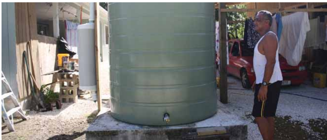
Installed water tank, Niue.

Making householders responsible for maintenance of the system and contributing to the cost strengthens ownership and adds to sustainability of water security outcomes.