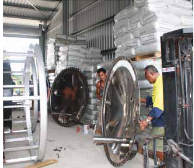
Tank moulding plant developed to produce water tanks in Niue.

With funding available from the Pacific Adaptation to Climate Change (PACC) programme and the Global Climate Change Alliance (GCCA:PSIS) project, Niue embarked on an ambitious programme to provide an alternative water source. Rainwater harvesting was identified as the most suitable option for strengthening water security in Niue.