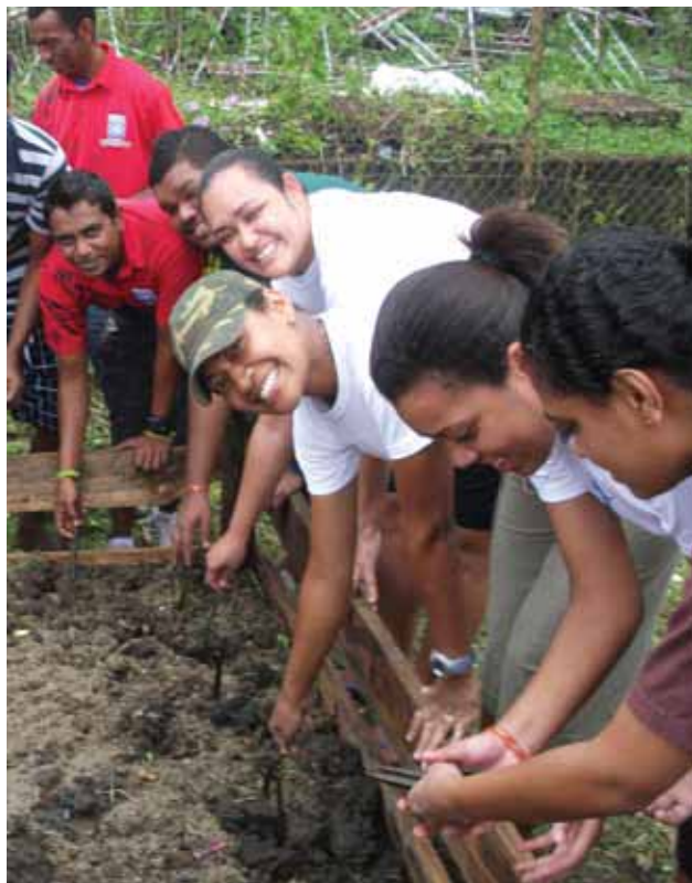
Mangrove seedling planting at Lami Town Council Depot nursery.

Lami Town Council has recognised the importance of fostering climate change awareness within its community by taking ownership of the vulnerability assessments and developing cost effective adaptation measures to create a resilient and green Town.