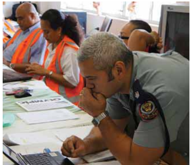
Simulation exercise 2013.

Simulation scenarios should be developed in consultation with the community well in advance of the exercise with regular meetings and ideally be based on a real event experienced by the community. This ensures the scenario is realistic and, as the community will be able to identify with the scenario, will facilitate their involvement, especially with role playing. Through this experience the community is better prepared for the next disaster event.