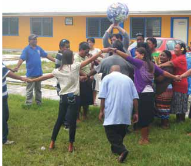
Science teacher training in the Republic of Marshall Islands.

Focus group sessions identified that beneficiaries most appreciated the Emergency Response Training and Medical Kits for schools, the co-teaching model where trainers visit classrooms and work together with local teachers in delivering CCA and DRR lessons, and participatory process that led to community driven projects.