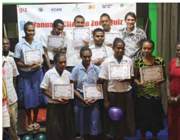
A new SMS 'public - private partnership' competition was part of the annual Vanuatu Climate Zone Quiz.

In Vanuatu, the establishment of the National Advisory Board (NAB) in 2012 has gone some way to improving the management of CCDRM initiatives. PRRP is working with the NAB to further strengthen 'risk governance' through the integration of CCDRM into development, particularly within national development planning processes across all development sectors (with a focus on agriculture and education), and sub-national level development planning in target provinces and communities.