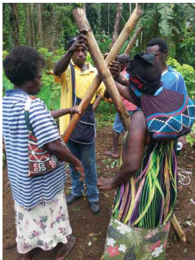
Building a verticle vegetable garden in Nissan District.

Bottom-up planning introduced by the community DRR action planning processes has been a highly effective way of identifying risks that may not have been identified using a top-down approach. For example, this process identified the increasing rarity of traditional medicinal plants, which led to collaboration with the Bougainville Traditional Health Project to promote the establishment of traditional medicinal plants in project supported nurseries to ensure they are available for future generations.