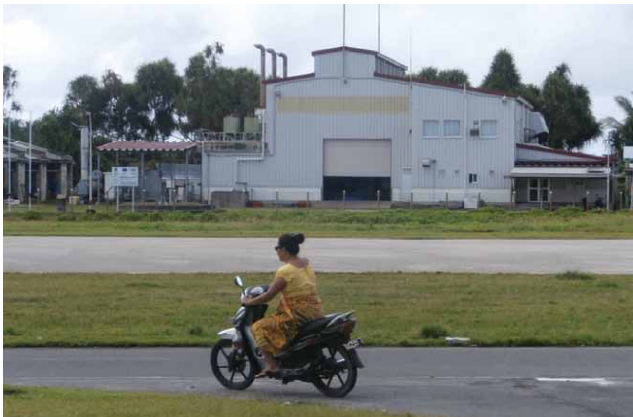
Tuvalu Electricity Corporation.

For remote Pacific Island communities, hybrid solar power systems can improve daily access times to electricity which can improve education and community services. Moving away from reliance on imported diesel for electricity production increases the resilience of communities. This prevents them from being subject to fluctuating diesel prices and limited supplies during times of climate hazards, such as cyclones.