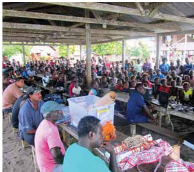
Vulnerability assessment in Choiseul.

In 2012, the Government of the Solomon Islands proposed to adopt a more integrated and holistic approach to CCA and mitigation at the province-wide level to help improve coordination and alignment of support, as well as the impact of planned development interventions. An integrated, programmatic ridge-to-reef approach was envisaged where government agencies, development partners and non-government organisations work in a multi-sectoral 'programme' in one province to strengthen the resilience of the local population against climate change. Choiseul Province was selected for trialling this new approach.