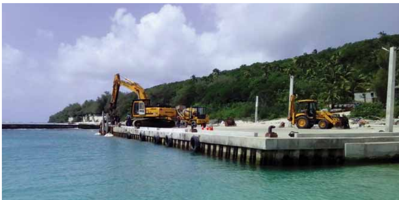
Construction at the Mangaia harbour, Cook Islands.

Good communications and collaboration with other government agencies is also important, to keep everyone updated and informed, and also to optimise opportunities to work together. For example, the project worked closely with the Ministry of Internal Affairs (Gender Division) to incorporate gender perspective into the project.