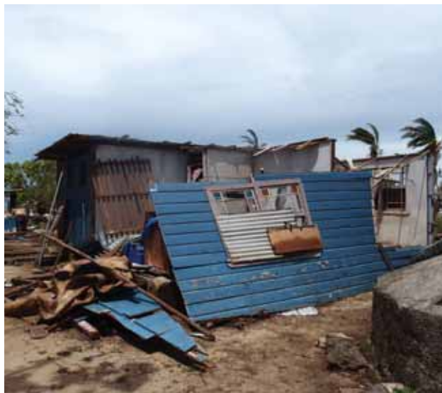
Damage after Tropical Cyclone Ian in Tonga, 2014.

This regional sovereign insurance programme is made possible through the collective efforts of the Government of Japan, the World Bank, the Global Facility for Disaster Reduction and Recovery (GFDRR), and the Secretariat of the Pacific Community (SPC). The third season for the insurance pilot programme (2014 to 2015) covers five countries (Cook Islands, Republic of Marshall Islands, Samoa, Tonga, and Vanuatu).