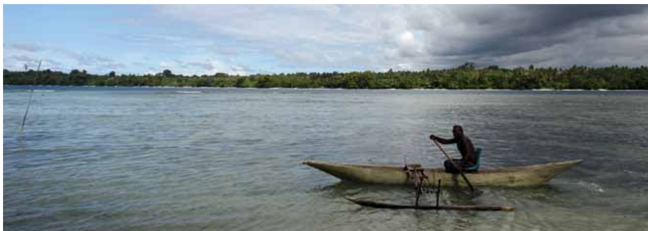
Nissan District, Papua New Guinea.

Trends, challenges, solutions and lessons are drawn from these case studies, which may serve as a guide for the design of future initiatives to be implemented under the SRDP and provide a reference for the Pacific and other regions of the world. This compendium refers to lessons learnt as knowledge acquired from observations and experiences. Lessons in this compendium may arise from positive or negative experiences. In both cases, these have led to insights which may benefit the development of future initiatives for climate and disaster resilience.