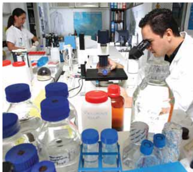
Development of refined laboratory in vitro tests routinely used at Institut Louis Malarde, Tahiti, French Polynesia, for the detection of seafood at risk of Ciguatera.

There is an urgent need for a policy to support all government measures aiming at the development of remote islands, to reduce impacts on the complex and fragile ecosystems of the islands in French Polynesia and across the Pacific. There is also a need to strengthen information, education and public outreach actions for a better prevention of populations.