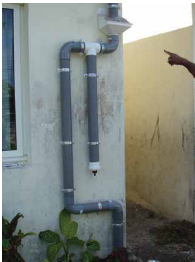
Newly installed water residential water system, New Caledonia.

The water safety planning approach develops a culture to ensure monitoring of water quality, maintaining infrastructure, and reducing wastage. This reduces public health issues building the resilience of communities.