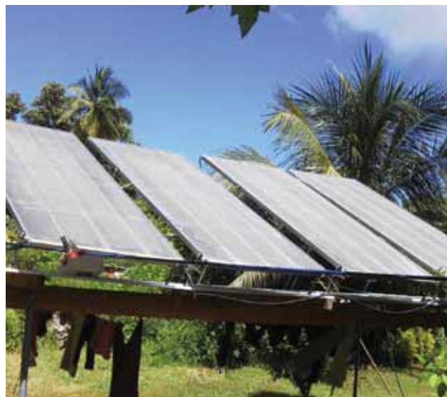
Solar panels installed for water purification in Nauru.

As water is one of the most vulnerable resources in the Pacific to climate change, priority must be given to establish the maintenance and operational support systems required to address and respond to a healthy and sustainable water sector. Setting up of an institution or management unit focusing solely on water, is a good governance practice that must be established immediately if not already in place.