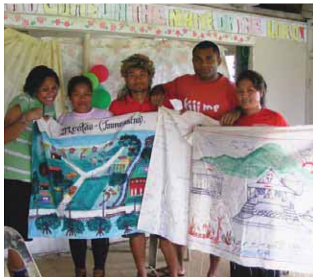
Youth workers displaying Youth Groups' community hazard and resource maps in Tongatapu, Tonga.

The growing youth population in the Pacific presents a range of challenges and opportunities. Realising the social and economic potential of young people will be critical to the development of many PICs given their sheer weight of numbers. Conversely, the failure to do so could be a significant source of instability in the region. Therefore, it is essential that Pacific nations develop strategies, which support the integration of young people as well as meeting their educational and employment needs. The Pacific Island Youth Leadership Programme targeted young people in rural areas and settlements and involved them in identifying the needs of their local community and developing practical local responses.