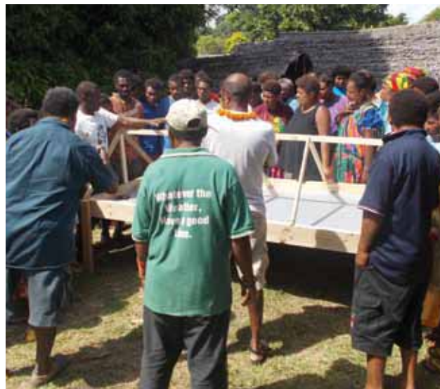
Tana community building fruit dryer, Vanuatu.

The Solar Fruit Drying initiative aims to enable women and communities to engage in an innovative, inexpensive and locally appropriate CCA strategy based on the existing gender-specific knowledge and set of skills. For example, the program allows women to further exploit and utilize the knowledge and techniques of food preservation they traditionally and culturally possess. The initiative also aims at empowering women financially, by providing a source of revenue-generating value-added dried products. Fresh produce is nearly impossible to market from many remote isolated islands, while dried products can be stored and sold whenever a ship reaches these women.