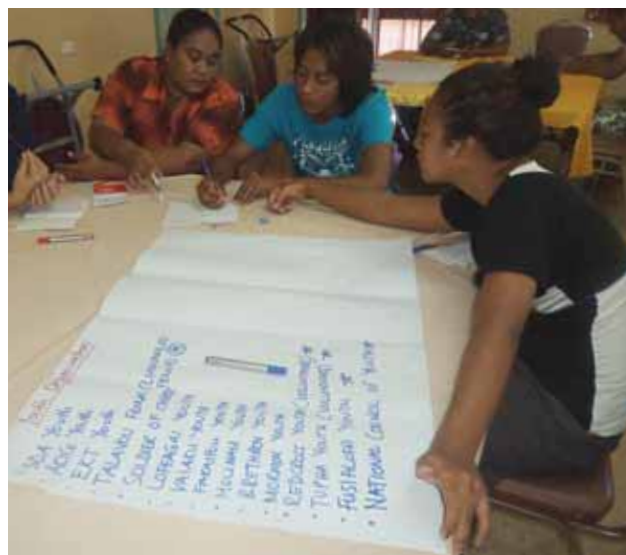
Inclusion of young people in DRR and CCA community planning in Tuvalu.

Monitoring and evaluation should not only foster compliance but also support learning.