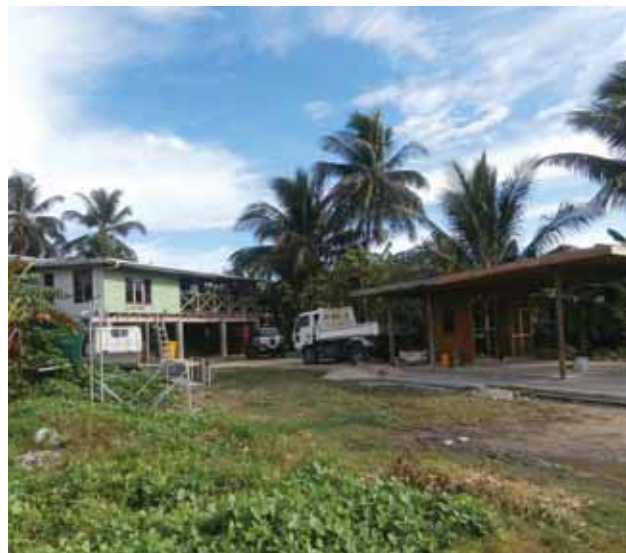
Site for installation of on-grid solar PV system.

The Tuvalu Photovoltaic Electricity Network Integration Project has been set up to fulfil electricity needs for the school while reducing Tuvalu Electricity Corporation's dependence on imported diesel, therefore, contributing to Tuvalu's plan of combating the escalating price of imported fuel, particularly for the island of Vaitupu. Tuvalu has a target of obtaining 100% of its electricity generation from renewable energy sources by the year 2020.