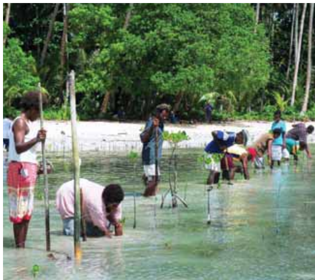
Villagers planting mangroves in Ngwawa Village, Solomon Islands, as part of their climate change adaptation activities.

The main purpose of the USP EU GCCA program is to develop and strengthen the capacity to adapt to the impacts of climate change of countries identified in the African, Caribbean, and Pacific Group of States (ACP). This is achieved through training of national and regional experts on climate change and adaptation, as well as the development and implementation of sustainable strategies for community adaptation to climate change, based on improved understanding of impacts of climate change and variability in the Pacific region.