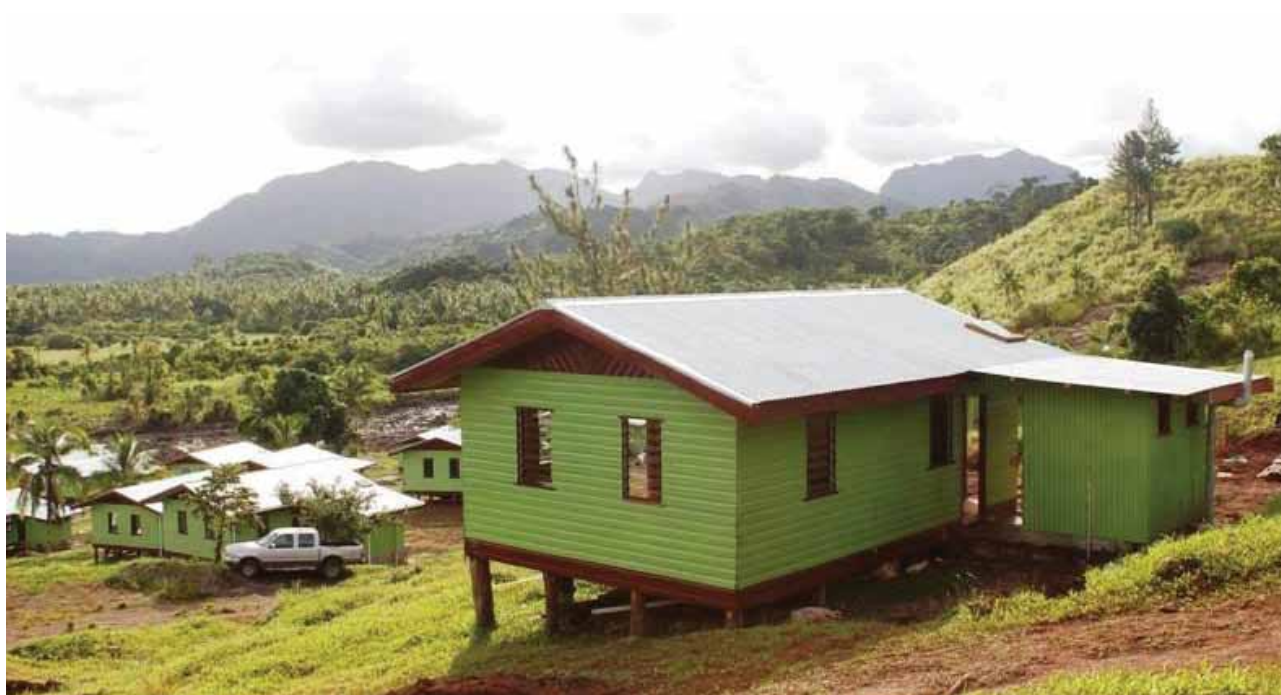
Relocated Vunidogoloa village in Vanua Levu, Fiji.

The Government of Fiji is looking at long-term solutions and has shown genuine concern for the plight and welfare of its people.