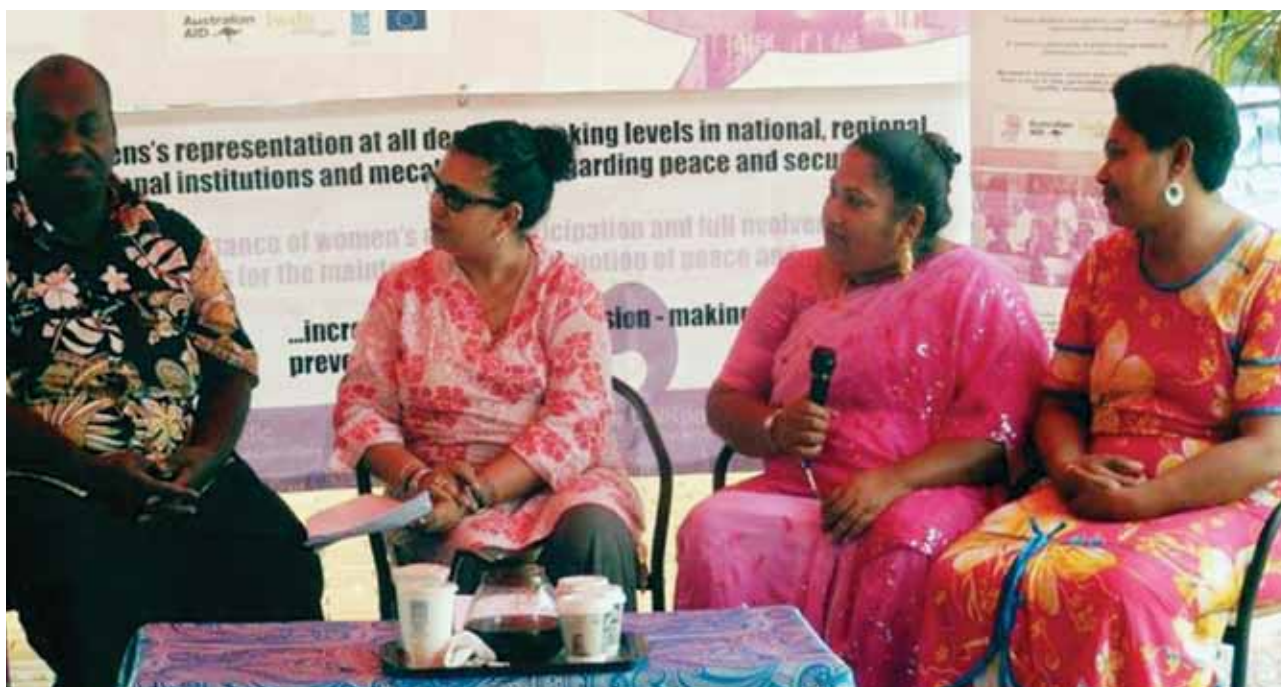
'Radio with Pictures' combined community radio broadcasts with television simulcasts to enable rural women to be seen and heard on key issues such as environmental security.

Communication strategies are important tools for community radio. They can be utilised to highlight issues related to climate change, disasters and community vulnerability.