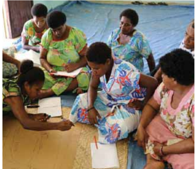
Community members developing their own hazard maps.

In response to these challenges, the Government of Fiji requested support from the Government of Japan and the Strengthening of Community-Based Disaster Risk Management Project was developed across the Pacific Region. Japan International Cooperation Agency (JICA) implemented the pilot project in Ba, Northwest of Viti Levu Island of Fiji to develop a system in which the residents of the selected community areas are able to evacuate appropriately in time of disaster.