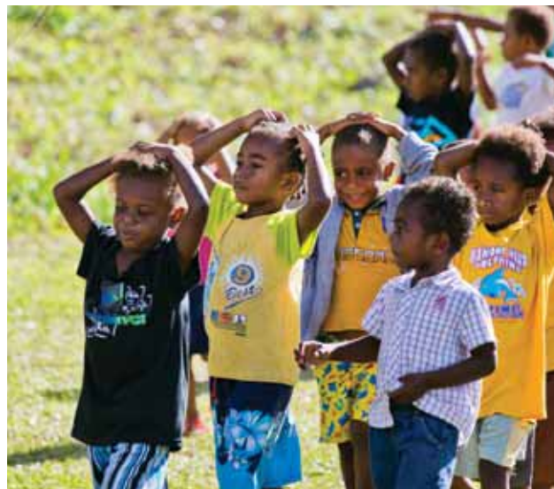
School children undertaking evacuation exercise.

The Enhancing Emergency Preparedness and Disaster Risk Reduction Strategies in Fiji, Tonga and Vanuatu project aimed to reduce the loss of life and economic impact of disasters through the strengthening of disaster preparedness and response plans in advance of disaster events. The project supported the running of disaster preparedness and response simulation exercises.