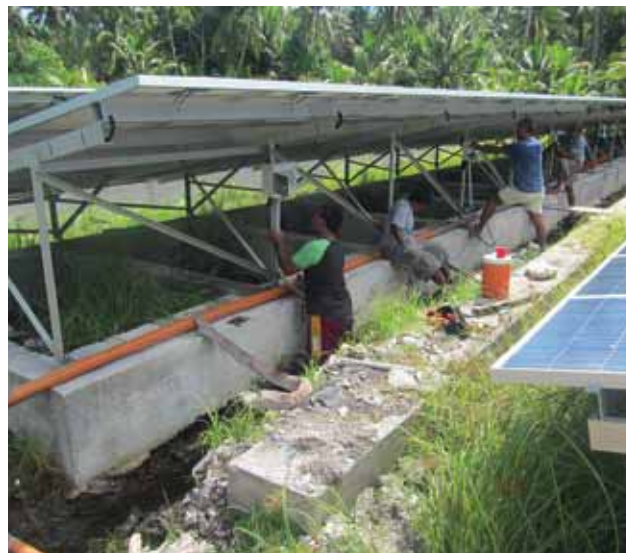
Local energy staff connecting cables on the Solar PV system.

The project was the result of a decade of preparation starting with a comprehensive national energy assessment in 2003 funded by United Nations Development Program (UNDP). This fed into a 2004 Tokelau Government policy to shift to 100% renewables in order to lower dependency on external fuels, maintain the pristine atoll environment from pollution by oil spills and diesel exhaust, and to improve energy security.