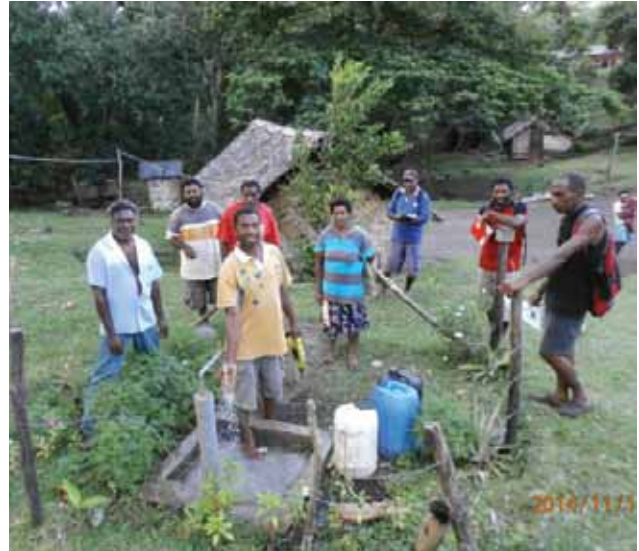
Community members in Wilit, North Ambrym enjoying piped water from a protected water source.