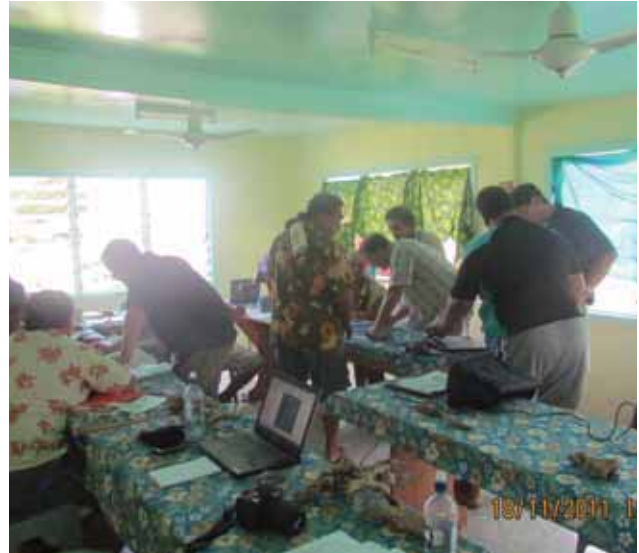
Community meeting to obtain local knowledge regarding extent of stormsurge and cyclone wave run-up around Mangaia.

The aim of the Pacific Adaptation to Climate Change (PACC) project is to contribute to reduced vulnerability and increased adaptive capacity to adverse effects of climate change in the Cook Islands. In order to achieve this the project aimed to develop a stronger and safer harbour that can withstand current and future climate-related threats. In parallel, the project has helped to develop an integrated coastal management policy and plan for Mangaia.