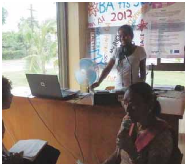
Taking the 'suitcase radio' out to women in rural centres brings women together through pre broadcast consultations and on the airways.

Radio is one of the cheapest mass medium, reaching out to large numbers of people in isolated areas. It has been used to disseminate information and early warning messages. Radio, especially community radio, has proven to be an effective tool for disaster management as it is an efficient means to deliver information suited to the needs of the community, packaged in local language.