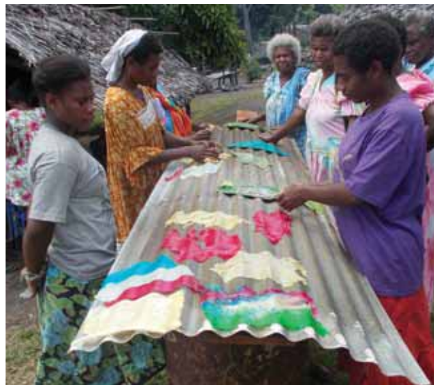
Tanna women drying manioc, Vanuatu.

This toolkit focuses on programme managers and supporting them in the understanding of the importance of gender and social inclusion to achieve project outcomes.