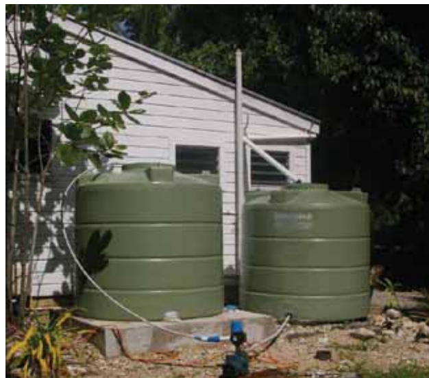
Tanks, guttering, and pipes installed on house by the PACC project.

To reduce vulnerability and to increase adaptive capacity to the adverse effects of climate change the Tokelau Pacific Adaptation to Climate Change (PACC) project objective is to contribute to reduced vulnerability and increased adaptive capacity to adverse effects of climate change in Tokelau.