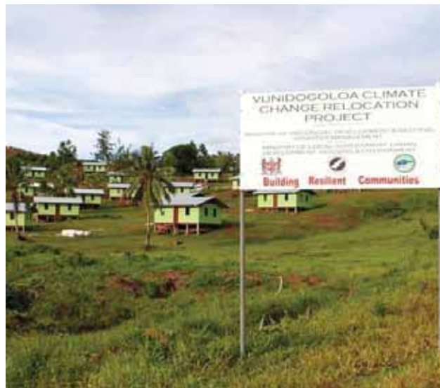
Relocated Vunidogoloa village in Vanua Levu, Fiji.

Vunidogoloa village was identified for relocation in 2010 by the Government of Fiji after the events of Tropical Cyclone Tomas. It was noted from preliminary inspection that the village was succumbing to flooding during heavy rain and high tide. This raised health concerns due to the lack of waste disposal management and community housing rotting. Due to such impacts, a new village location over the hill (2kms inland) known as Cevuvu Settlement was identified alongside the main Saqani Road.