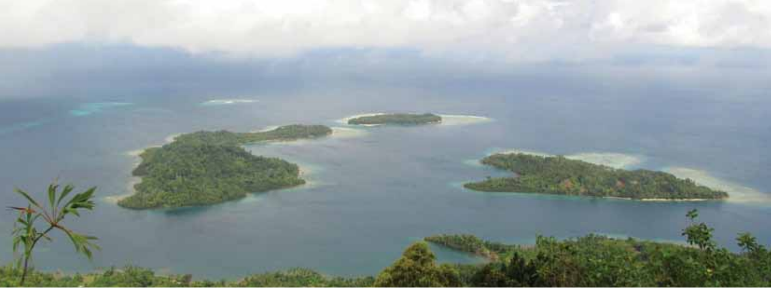
South Choiseul, Solomon Islands.