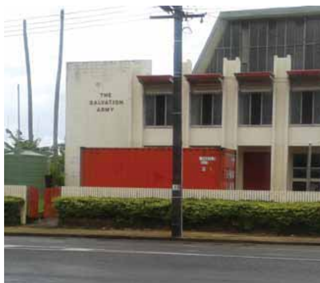
Salvation Army Evacuation Centre with container and water tank.

Education is a vital component of disaster preparedness and the definition of what needs to be included in this is continuing to widen.