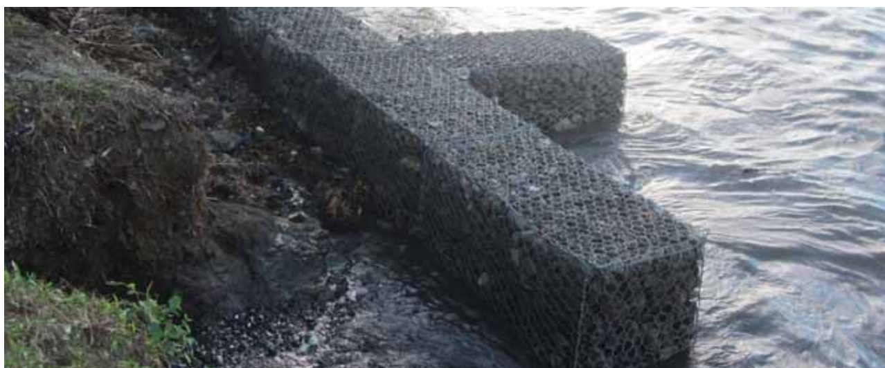
The first stage of the gabion wall to minimise storm surge impacts on the coastline.

Child representatives are very effective in educating their families, and passing on key knowledge to parents and communities about DRR and DRM. In particular, children aged 10-15 years of age should be included in all DRR meetings and trainings, and utilised as representatives and leaders in awareness-raising activities.