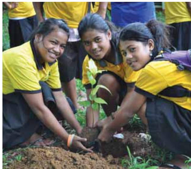
Sekere Elementary School, 8th Grade students planting to reduce risks of landslide on their campus.

The Climate Adaptation, Disaster Risk Reduction and Education (CADRE) programme originally started as a small scale pilot program for six schools in Pohnpei funded by the United States. There was a Pacific Wide Tsunami alert and the United States ambassador was aghast that many people in Pohnpei did not respond appropriately to the alert and were not aware of what to do in the case of a tsunami threat. The International Organisation for Migration (IOM) was asked to develop a public awareness raising program and also to work with schools on safety programming to address natural hazards. The pilot program enjoyed great success and Australia saw the potential to make a more comprehensive program to improve DRM in the region.