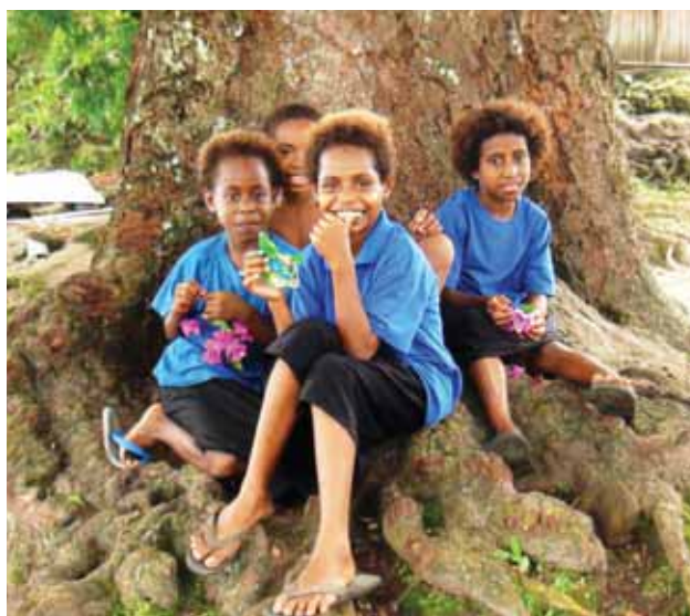
Krangket Elementary School girls, Papua New Guinea.

The 4CA model builds on Plan International's child-centred DRR model for communities vulnerable to disaster and climate change. The programme has a focus on vulnerable communities in coastal and remote areas.