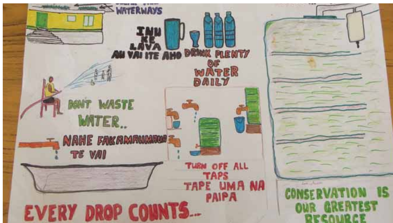
Winning poster in school competition which is part of the PACC project's awareness raising.

People in the Pacific know about the climate and have witnessed changes. So climate change should be related to what they know, rather than presented as a new issue.