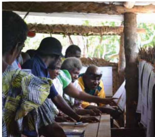
Community consultations conducted in Vanuatu. Feedback was incorporated into the final products.

The animation project benefitted greatly from a dedicated Australian Red Cross volunteer who worked for 12 months on the project at the Vanuatu Meteorology and Geohazards Department office. The consultation and coordination required were far greater than was ever envisaged, and having a dedicated coordinator meant the project kept to deadlines. For many team members the project was only one of the many projects on their agendas, and it required ongoing commitment and constant input for more than one year.