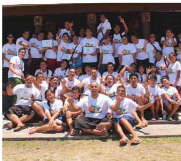
Students from Samoa celebrate the final A2C2 showcase event at the National University of Samoa.

Awards for climate change and journalism/media are a useful mechanism to facilitate exposure to climate change in the university and school curriculum, and encourage youth to explore future careers in climate change and/or media.