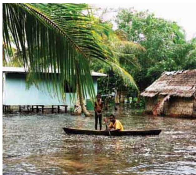
King tide flooding the village.

Based on experiences from existing 'in-country' local climate change networks, it can be seen that they can improve the sharing of information and best practices amongst Pacific Island communities. Participants of the local climate change networks are motivated to work together because they want to be able to take actions that have a high chance of measurable, long-term success. For example, a network is proposed to create a multiplier effect among communities not covered by the project, which will gain knowledge and skills from their exposure to locally-managed concepts on adaptation to climate change.