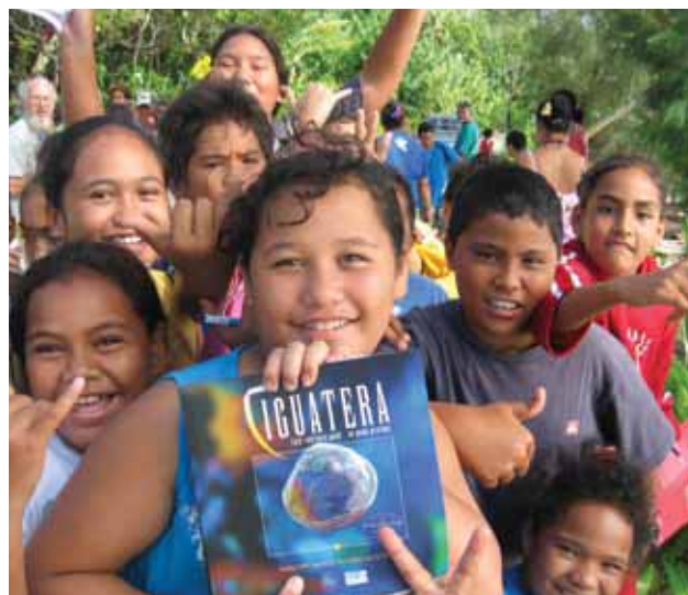
Education and public outreach actions targeted at the youth of the island of Raivavae, Australes, French Polynesia.

French Polynesia is regarded as a long-standing hotspot of Ciguatera in the Pacific. Indeed, marine products such as fish, giant clams and trochus are used as a subsistence resource by many local communities, who are therefore highly vulnerable to this hazard.