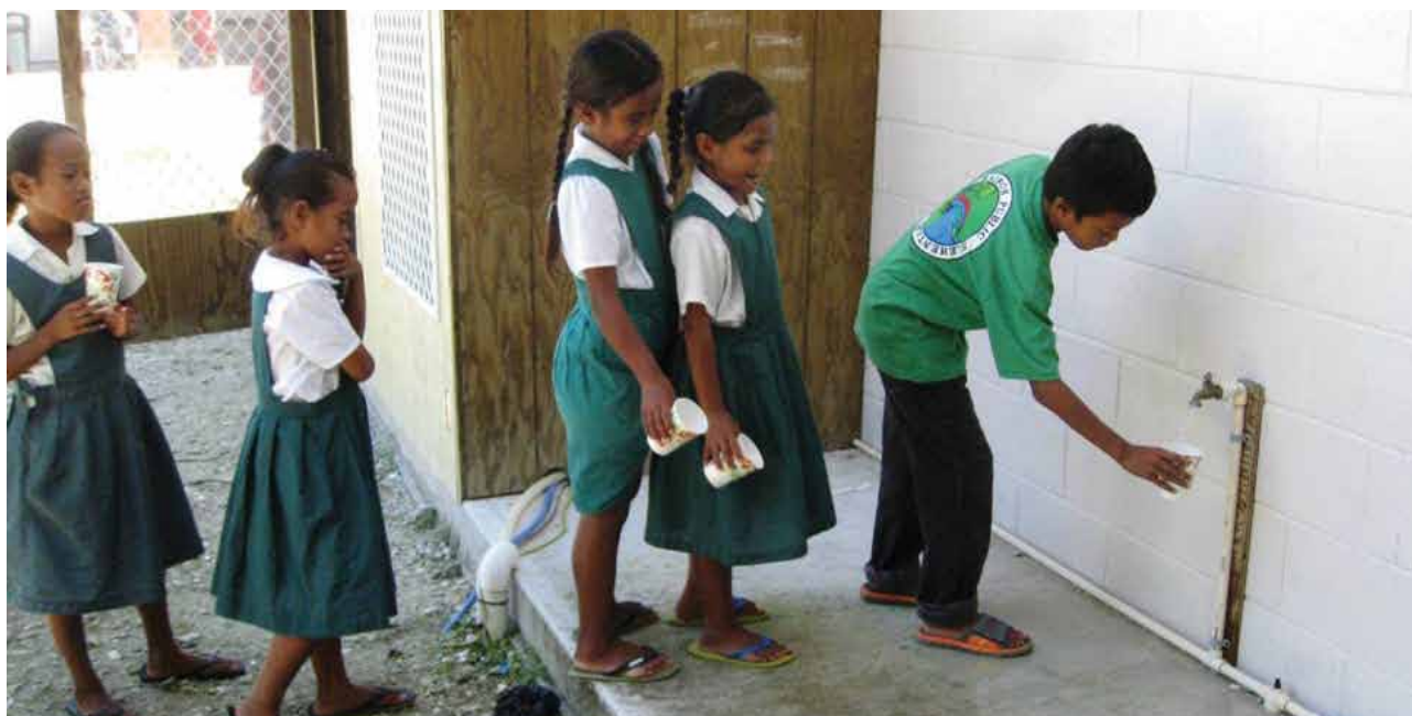
Students of Rairok Elementary School lining up for water, Republic of Marshall Islands.

The sustainability of infrastructure projects needs to be considered during the proposal development process as well as during implementation with all the relevant stakeholders to facilitate sufficient planning, commitment of resources and capacity to continue to operate and maintain the systems.