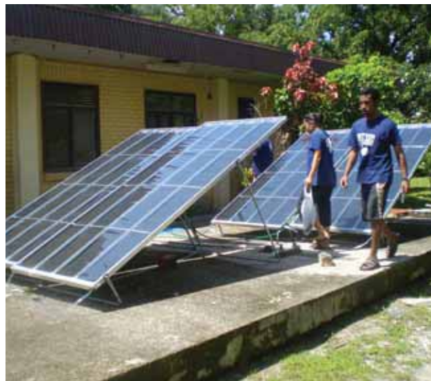
Solar panels installed for water purification in Nauru.

To reduce vulnerability and to increase adaptive capacity to the adverse effects of climate change, the Pacific Adaptation to Climate Change (PACC) programme in Nauru aimed to reduce the impacts of drought by improving management of the island's water supply.