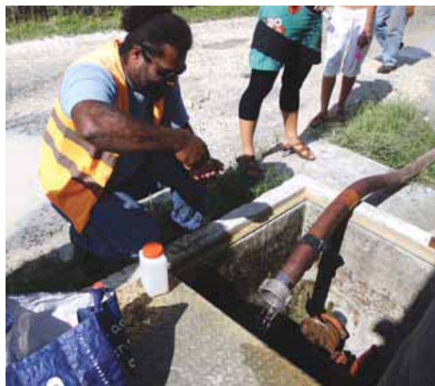
Monitoring the water supply system in New Caledonia.

The Reducing Public Health Risk in New Caledonia through Water Safety Planning Project aimed to enhance country capacity to reduce drinking water sanitary risk and work with municipalities to be more attuned to sanitary risk with tools and support to reinforce the safety of their drinking water.