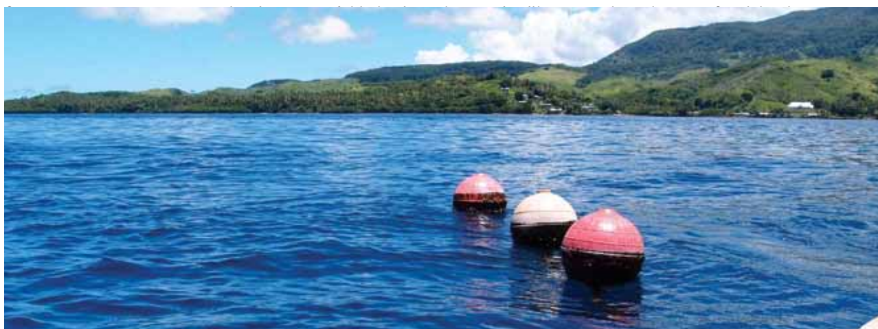
A submerged fish aggregation device (FAD) in Qarani, Gau.

Awareness and empowerment of local communities are necessary to attain the desired changes that are needed.