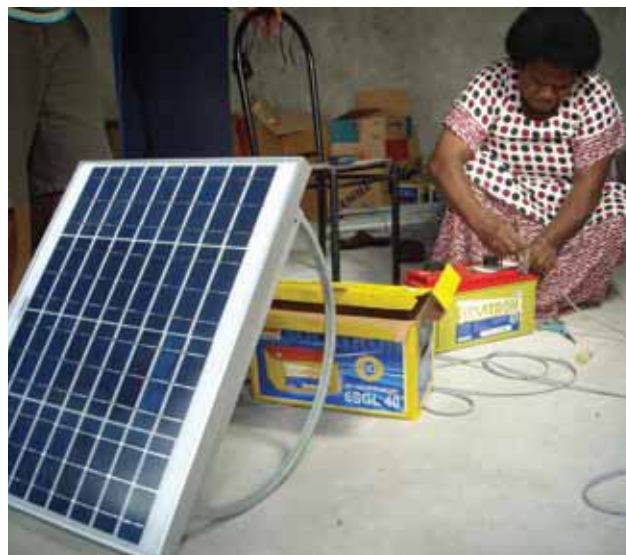
Solar panel for the dryer.

Working in partnership, including grass roots women's groups and communities, including private sector experts, national and provincial government, regional technical agencies and international development partners can add value and provide insight towards successful outcomes.