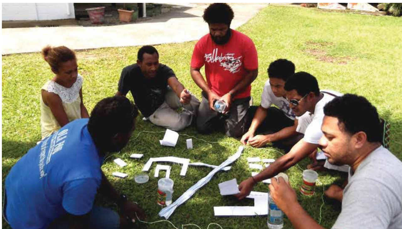
Hazard vulnerability identification with youth workers from Solomon Islands, Papua New Guinea, Vanuatu, Fiji and Tonga during training in Deuba Fiji.

A key method of preparedness is raising awareness around disasters and understanding local strengths and vulnerabilities.