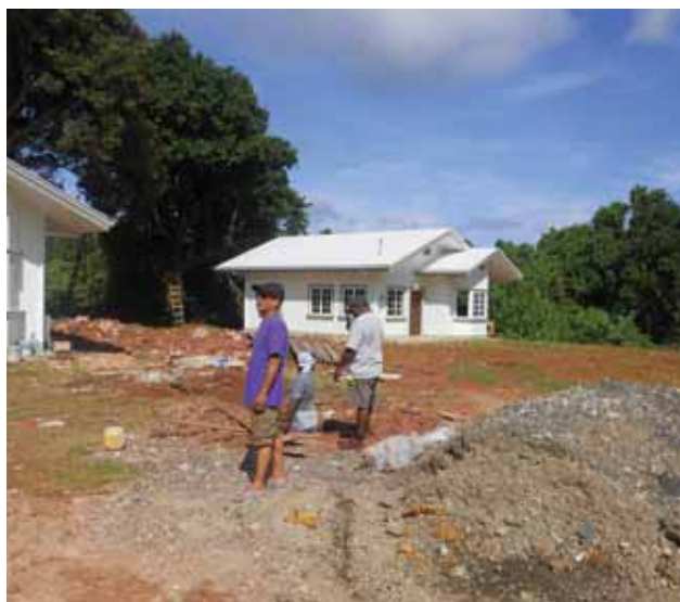
Newly constructed energy efficient housing in Palau.

Energy efficiency measures are less expensive with more immediate results than other greenhouse gas emission reduction options.