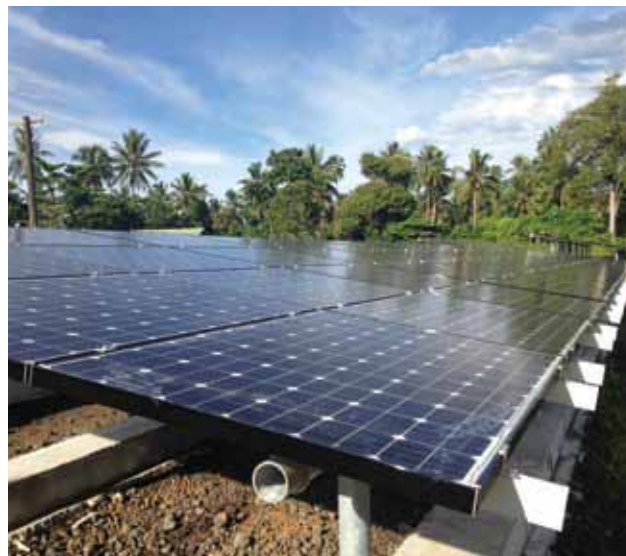
Solar PV System, Samoa.

The goal of the Pacific Island Greenhouse Gas Abatement through Renewable Energy project in Samoa, as well as in the other 13 countries that are part of the project, has been to reduce the growth rate of greenhouse gas emissions from fossil fuel use through the removal of the barriers to the widespread and cost effective use of feasible renewable energy technologies. This has, and will be, achieved by removing barriers for renewable energy technologies. For example by investing in training and capacity building in public institutions, communities and households; providing the data needed to develop renewable energies including monitoring studies, feasibility studies and other data collection.