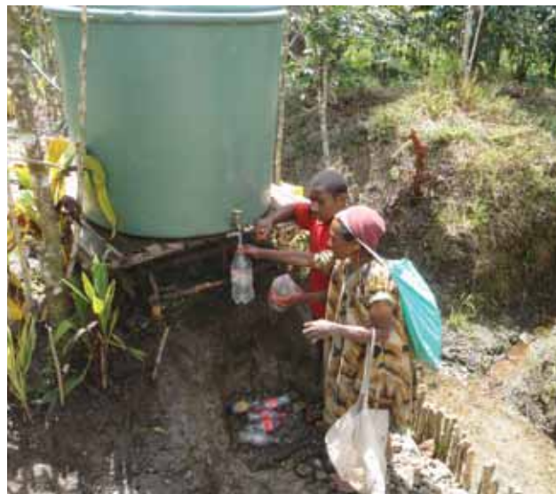
Youth volunteers construct bamboo aqueduct, March 2010.

Alex Dui, a Red Cross youth volunteer with the Western Highlands Province Branch of the Papua New Guinea Red Cross Society worked with a diverse group of village members to build on traditional leadership processes and facilitate the development of community projects, including building a water supply system and then re-building it to improve access to a cleaner water source. Alex's initiative as a Red Cross volunteer set off a chain reaction of inclusive participation and vulnerability reduction that has become a part of the culture of Kindau.