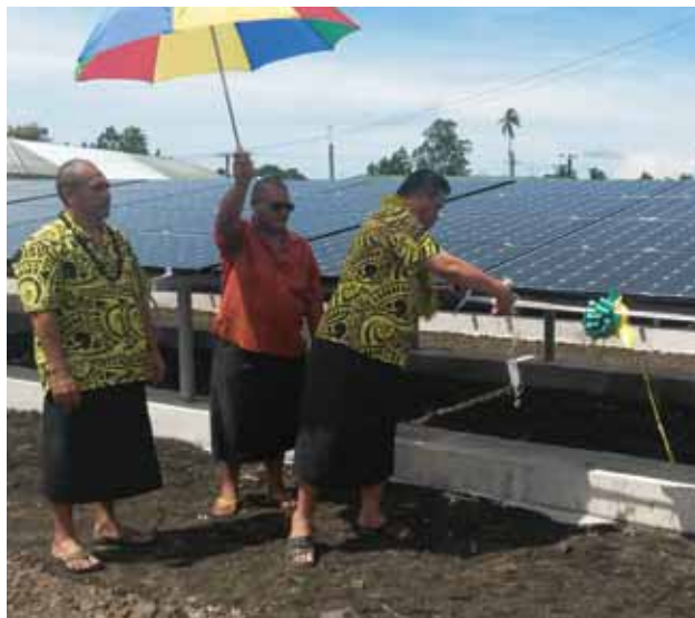
Commissioning of the Samoa grid connected PC system in Savai'i, Samoa.

Each Forum Island country is allocated an indicative amount of USD $4 million to invest in solar power generation or sea water desalination infrastructure projects, coordinated by the Pacific Islands Forum Secretariat (PIFS). In addition, countries can combine the two technologies through the installation of solar powered sea water desalination plants.