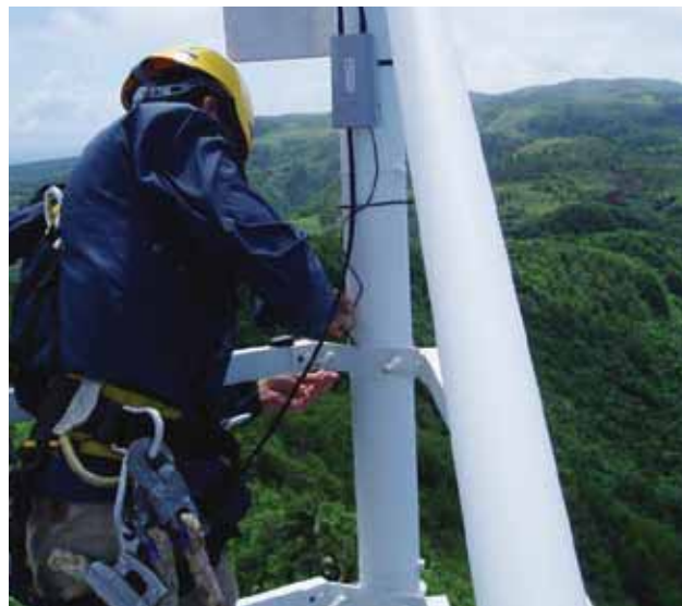
Network installation services by Radiocom, Futuna.

In order to do this, more accurate assessment of the tsunami hazard was required. The Secretariat of the Pacific Community (SPC), in partnership with the National Institute of Water and Atmospheric Research New Zealand and the French Institute of Research for Development provided Wallis and Futuna with critical information to support tsunami planning. This included inundation maps outlining zones at risk and reaction time based on specific tsunami scenarios. The project aimed to improve the territory's capacity to manage disaster situations and falls under Wallis and Futuna's long-term efforts to improve civil security following significant damage on Futuna after Tropical Cyclone Thomas which hit the territory in March 2010.