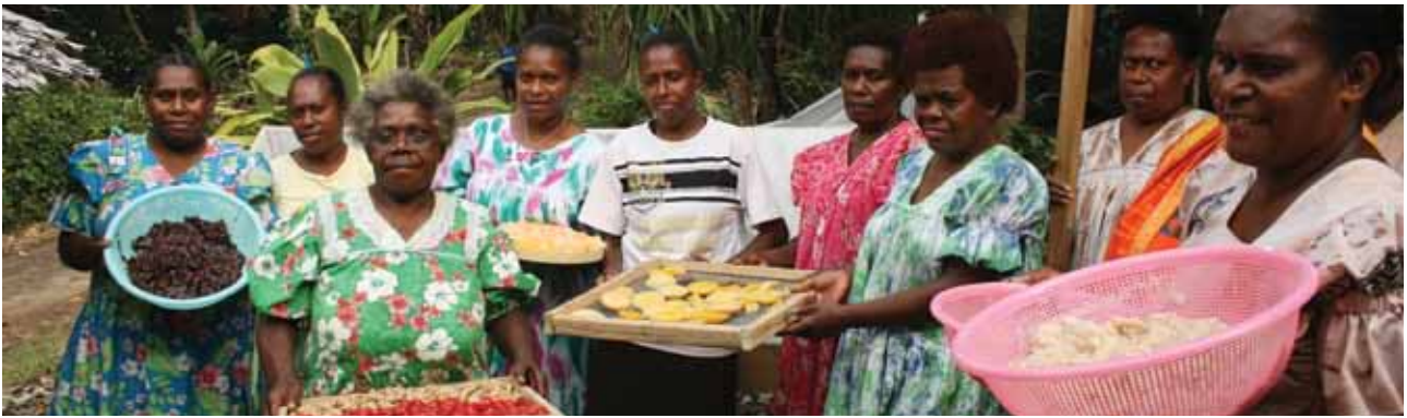
Solar Fruit Drying Training, Nguna, Vanuatu.

The participants from the Training for Trainers, immediately put their skills into practice by running a two-day introductory training course on Gender and Climate Change attended by 32 staff members from SPC, Foundation for the Peoples of the South Pacific (FSPI), Young Women's Christian Association, and Pacific Youth Council.