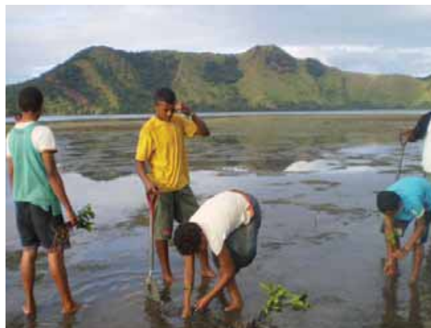
Gau Secondary School students planting mangroves in Nawaikama, Gau.

The Lomani Gau project encourages local communities to care for and sustainably use their environment and natural resources that they depend on for sustenance and income generation. The project promotes integrated resource management to secure alternative sources of livelihood that can support the people's sustainable development aspirations.