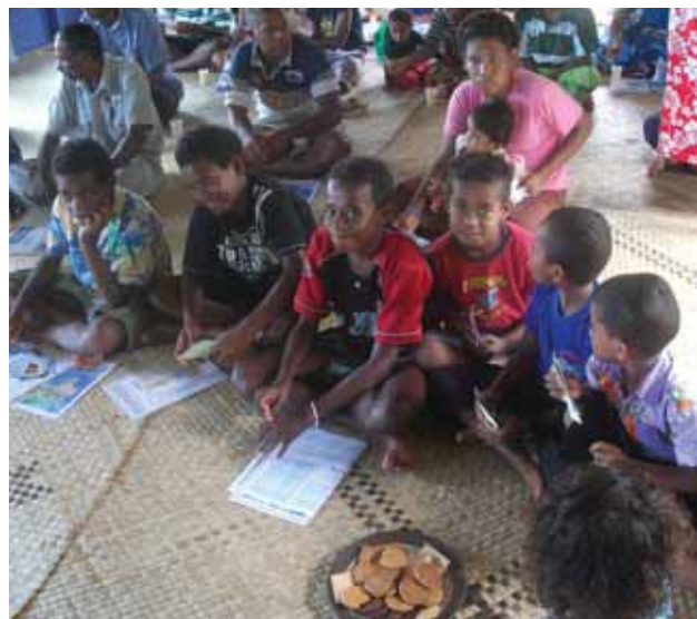
Climate awareness meeting at Kalekana Community Hall, Lami, Fiji.

Lami Town is located on Viti Levu in Fiji, and is considered part of the greater Suva area, occupying the inshore coastline of Suva Harbour. Lami Town and adjacent peri-urban areas comprise a mixture of formal and informal settlements with approximately 21,000 people. Located in a mountainous coastal zone with steep hills and three rivers flowing to the ocean, the town is highly vulnerable to flooding and erosion. The natural protective resources available are mangroves, coral reefs, seagrass and mudflats. In order to address the current and future impacts of climate change, Lami Town partnered with UN Habitat's Cities and Climate Change Initiative to enhance policy dialogue awareness, education and capacity building. The aim is to firmly establish climate change within the towns corporate plan (annual), strategic action plan (five years) and the Lami Town Planning Scheme to support their efforts to bring about changes for adapting to climate change.