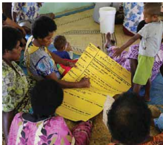
Community members discussing Disaster Response Plans.

Awareness raising is an important factor for encouraging governments and especially local communities to continue to invest not only financially, but also in kind labour for disaster preparedness.