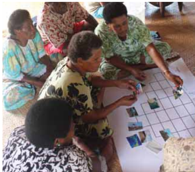
Community survey in Navutulevu, Fiji.

The project aimed to contribute to both analytical research and ideas on how key target sectors interact, in addition to provide tangible tools to teachers and communities for facilitating increased interaction through education.