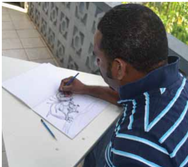
Many of the films' characters were conceptualised by Vanuatu based artist Joseph Siri, based on ideas generated by stakeholder workshops.

Research by the Red Cross Climate Centre found that, globally, there are few simple films on ENSO for use in training and planning. The Pacific Climate Animation Project, funded by the Australian Government Pacific Australia Climate Change Science and Adaptation Planning (PACCSAP) science program, aimed to increase awareness of the science of El Niño and La Niña and their impacts, and encourage discussion about how Pacific nations can access forecast information, communicate and work together to take early action to prepare for future El Niño and La Niña events. Complex concepts, such as ENSO and other climate drivers have been difficult to present to audiences using inanimate descriptions and photographs.