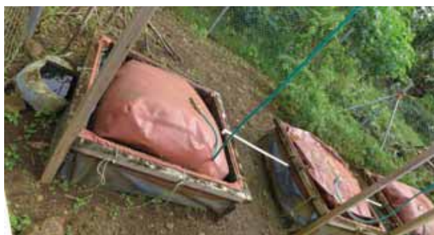
Samoa is developing its first ever biogas system for electricity generation. The project will use green waste, such as invasive vines, as fuel.

Utilisation of renewable energy reduces greenhouse gas emissions and improves resilience of communities by reducing reliance on external energy sources and the impacts of price fluctuations.