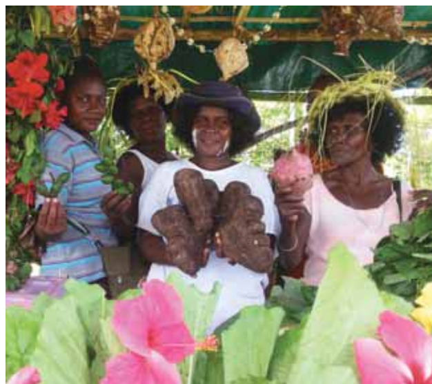
World Food Day participants in Nissan District.

The Community-Based Adaptation to Climate Change in Nissan District project aimed to increase adaptive capacity and resilience to existing hazards and the impacts of climate change on vulnerable women, men, and young people in the Nissan District through improved food security, nutrition, and DRM capacity. The project also aimed to incorporate CCA and DRM into local level planning and policy development.