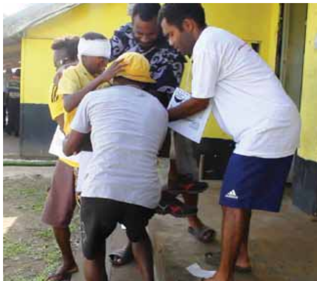
Simulation exercise with staff and students of Erakor Bilingual School.

The project leveraged the interest of school principals and teachers as well as the energy and enthusiasm of children and youth to address these issues. Rather than focussing on the production of planning documents, the strategy focuses on good guidance and a series of all-school activities designed to produce a plan-in action.