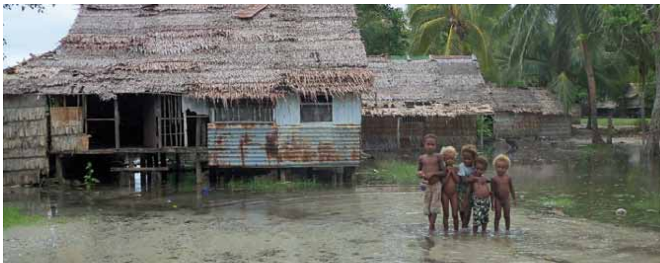
Children playing in the inundated village ground in Solomon Islands, Photo: University of the South Pacific.

These two frameworks are superseded by the Strategy for Climate and Disaster Resilient Development in the Pacific (SRDP). The strategy aims to strengthen the resilience of Pacific Island communities to the impacts of climate change and disasters by developing more effective and integrated ways to address climate and disaster risks, within the context of sustainable development.